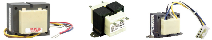
Class 2 Transformers

This group engineers, manufactures, markets and sells custom magnetic components including transformers, chokes and coils. Product classifications include Class 2 transformers, small power and industrial transformers, large dry-type power transformers, and value-added electromechanical assemblies. Transformers range in power from 5 VA to 2,800 kVA and are manufactured in two North American facilities. Standard products carry applicable UL/CSA approvals with custom products designed to meet various North American and international standards as dictated by the application and customer specification. Products are sold to OEMs (original equipment manufacturers) for incorporation into their end products.