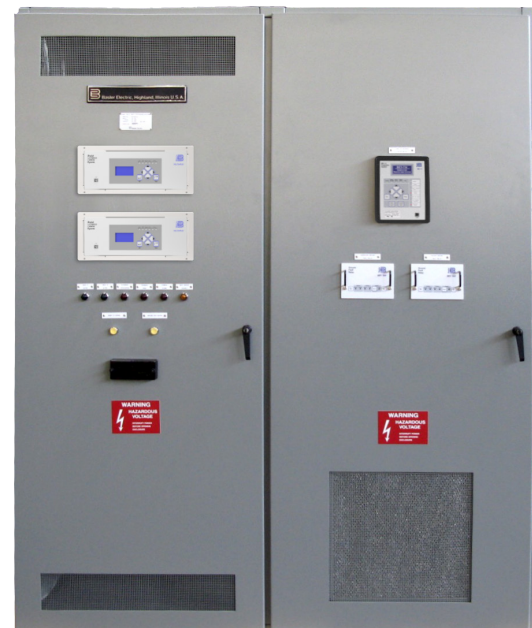
Dual DECS-450 Excitation System

Systems utilizing DECS-250, 250N, 250E, 450, or 2100 controls have expanded scope to fit a wider range of capabilities with field current up to 10,000 Adc. Complete excitation systems provide automatic voltage regulation, paralleling, and frequency compensation. These units are specified for replacement of rotary exciters or pilot exciters during power plant retrofitting or applied as original equipment in new facilities. They are applied to generators installed at electrical utilities, hydroelectric generating sites, and other large industrial generating facilities. These systems are also used in industrial motor applications.